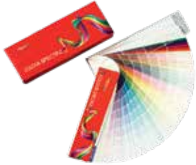
COLOUR SPECTRA FAN DECK